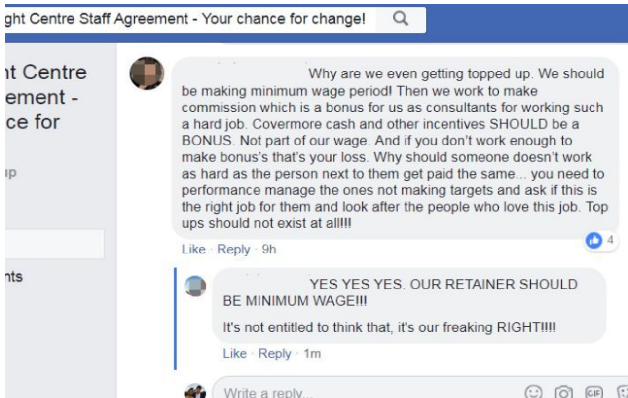
PHOTO: A closed Facebook Group where Flight Centre staff have been discussing the proposed EBA.

Flight Centre has now begun negotiations with staff over a new Enterprise Bargaining Agreement.